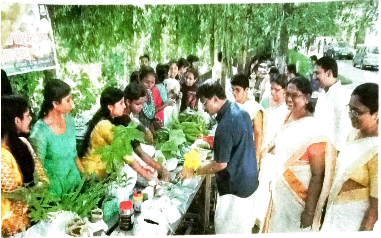
കോഴഞ്ചേരി സെന്റ് തോമസ് കോളജിൽ കാർഷിക വിളകളുടെ പ്രദർശനത്തിനും വിപണനത്തിനുമായി ഒരുക്കിയ 'വെജിറ്റോസ്-2017'.